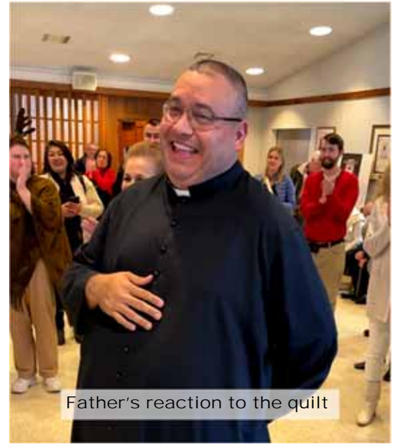
Father's reaction to the quilt