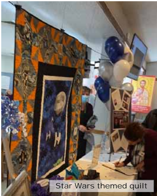
Star Wars themed quilt